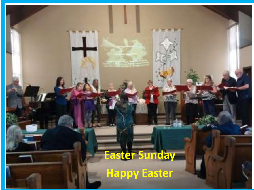
Easter Sunday Happy Easter